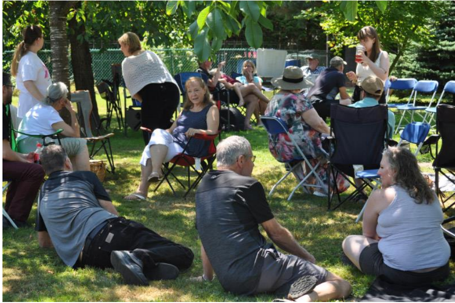
August Picnic with St Dunstan's

With the current provincial health guidelines in place, we are now able to have regular services in person every week at 8 am and 10 am at St Andrew's. It still feels a bit strange with everyone wearing masks and limited social activity before and after the service, but safety is the primary goal. We do plan to continue to offer the 10 am service on Zoom for those who can't make it into church.